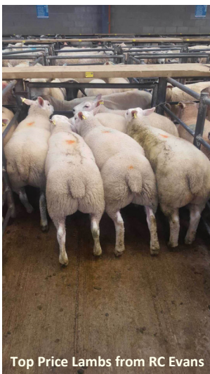
Top Price Lambs from RC Evans